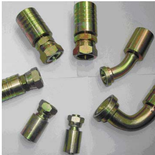
Hose Pipe Connectors: